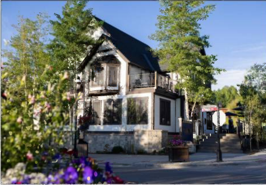
PROVIDED BY THE CARLIN

The focus of The Carlin in downtown Breckenridge is a seafood restaurant, but there are four welcoming and well-appointed guest rooms upstairs.